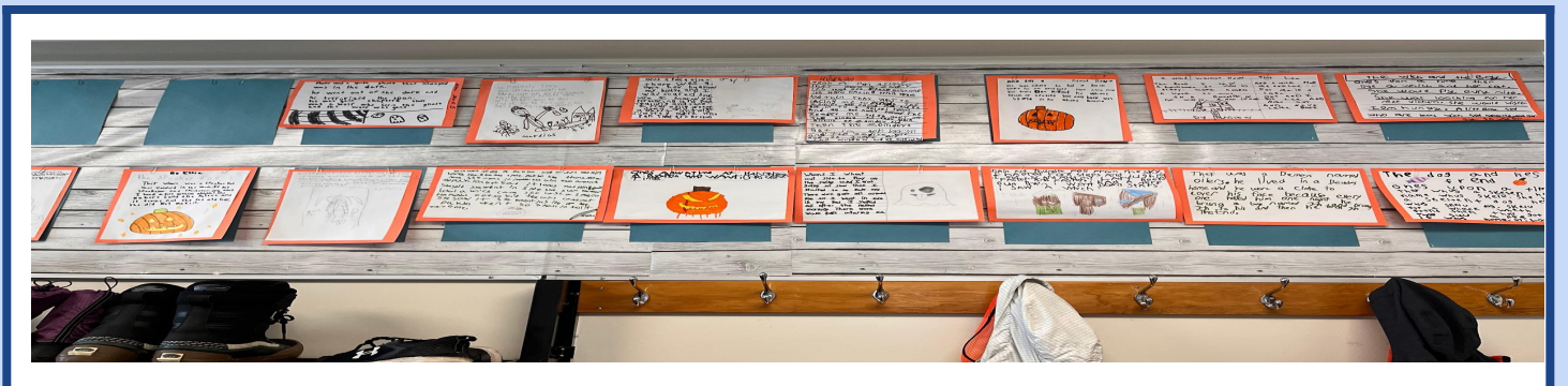
Pumpkin Writing: Grade 3