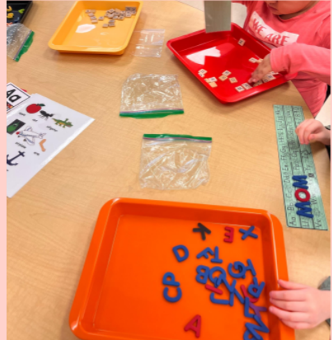
Kindergarten students exploring with early literacy skills.