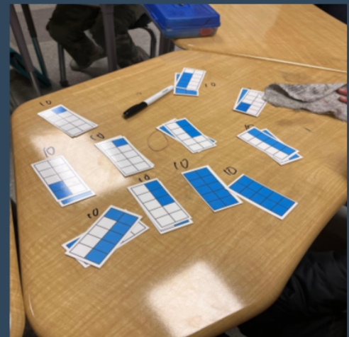
Active learning in numeracy small groups! Grade 3 and Grade 8 both using activities presented at our February PD.