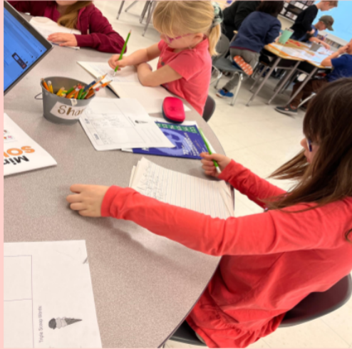
Small Group Writers focusing on "triple scoop" words