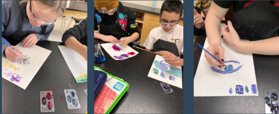
Grade 9 students using Science to create art. Great cross curricular project!