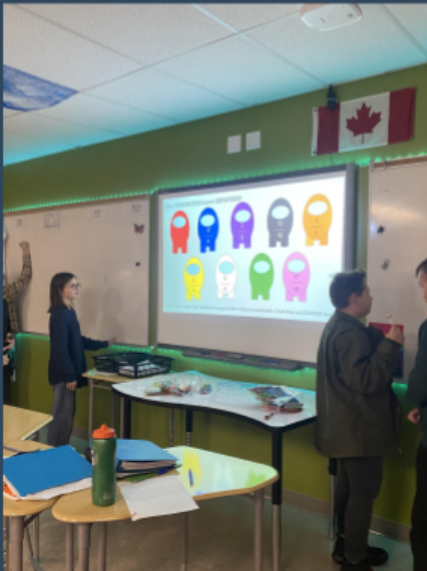
Grade 7: Finding "imposters" in fractions